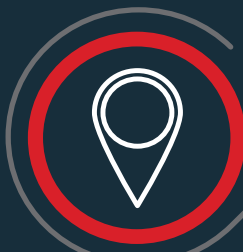
BALLOT DROP-OFF LOCATIONS