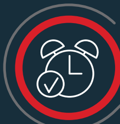
EARLY VOTE SITES